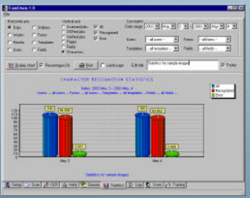
System administrators can generate detailed performance statistics to help manage for optimal productivity.

CharacTell, Ltd. www.charactell.com sales@charactell.com