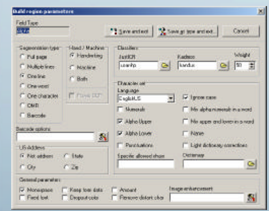
Each region is assigned optimized parameters for best results.